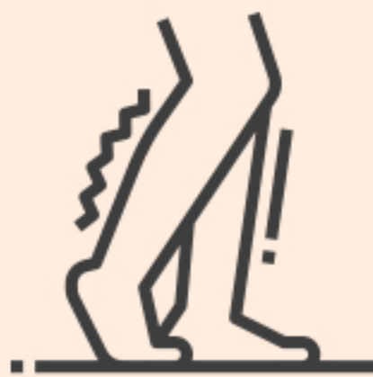
LEG PAIN OR SWELLING