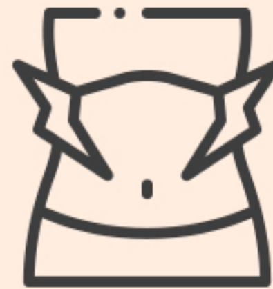
PERSISTENT ABDOMINAL PAIN