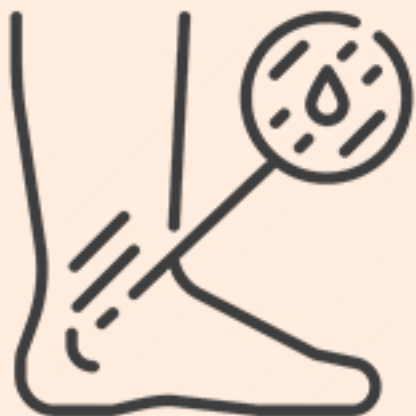
UNUSUAL SKIN BRUISING OR PINPOINT ROUND SPOTS BEYOND INJECTION SITE